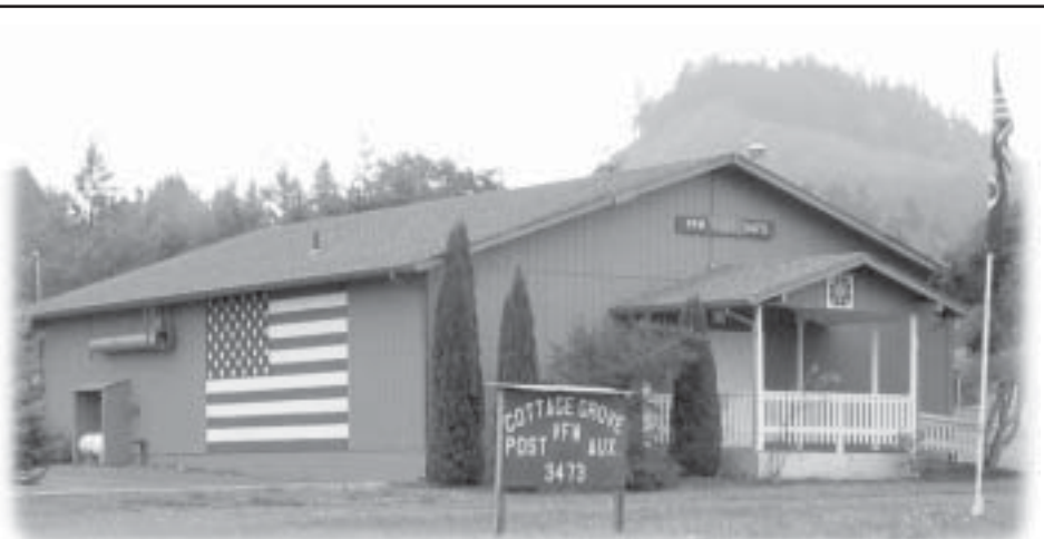
A.B.A.T.E. Planning Session home for the weekend – Cottage Grove V.F.W. hall

THE AIM/NCOM MOTORCYCLE E-NEWS SERVICE is brought to you by Aid to Injured Motorcyclists (A.I.M.) and the National Coalition of Motorcyclists (NCOM), and is sponsored by the Law Offices of Richard M. Lester. For more information, call us at 1-(800) ON-A-BIKE. Visit us on our website at: