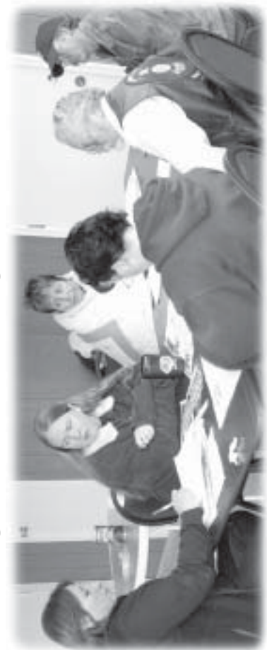
2008 Planning Session Members Plot and Plan Education Strategies Outside The Cottage Grove V.F.W. Hall

HOW CRYPTOGRAMS WORK: The idea here is that each letter in the cryptogram represents a letter of the alphabet. ("Y" might equal "L" for instance.) Look for word patterns to help establish which word is what. (Single letters will be "I" or "A"; "the" and "and" are common three-letter words; the most widely used English letter is "E".) Spies used to send messages using cryptograms because they kept their opponents busy trying to crack the code while the spies went about their skulldrudgery. Now days cryptograms is mostly recreational.