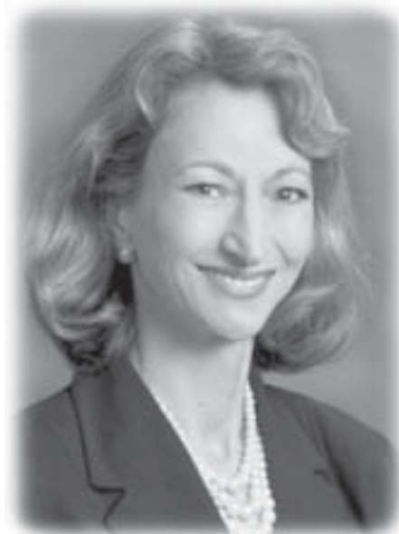
California state senator Debra Bowen

In 2006, California state senator Debra Bowen sponsored two important pieces of legislation on behalf of motorcyclists that were signed into law. The first allowed the use of non-custom (foam style) earplugs, and the second, co-sponsored by assemblywoman Bonnie Garcia, increased the penalties for drivers who violate the right of way of other road users and cause injuries. The latter bill is the type of legislation sought by the A.M.A.'s Justice for All campaign.