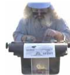
Rot Path crusty ol' editor

While editing this rag . . . intellectually stimulating printing every month, yer crusty ol' editor usually likes to sip caffeinated diet soda (or red wine) in the belief that it helps keep the brain cells ticking over. But recently he discovered that the soda brand he'd been guzzling sipping had quietly reverted to aspartame (causes cancer in lab rats when taken in unrealistically high doses) without calling attention to the fact. Feeling disillusioned by yet another corporate betrayal of profit-over-people, yer c.o.e. began looking around for a replacement beverage. (The box of wine was empty.) The criteria that c.o.e. came up with is that the drink be caffeinated, low sodium, and low sugar. (Yes, sodas that are supposed to be thirst-quenching often contain considerable amounts