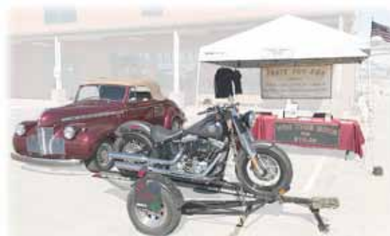
That is a show-stopping 1941 Chevy parked next to the toy run display at the Antique Powerland Steam Up on 04-05 August