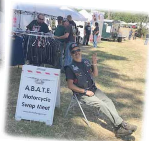
A hardworking loyal JoCo member helping with the A.B.A.T.E. booths