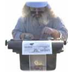
Rot Path crusty ol' editor

After making minor changes, the 'puter was rebooted, but it didn't even make it to the spinning-beachball-of-death phase. Instead it came up in the slightly more dreaded white-text-on-black-screen mode with some obscurely-worded alert, known in some circles of mythical hell as the command line interface.