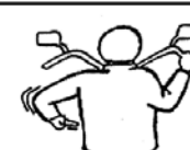
Time for a pit stop