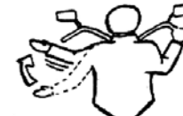
Go ahead and pass me