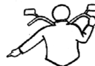
Hazards on the road