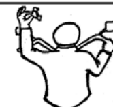
Turn off your turn signals