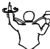
Start your engines