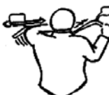
Stop your engines