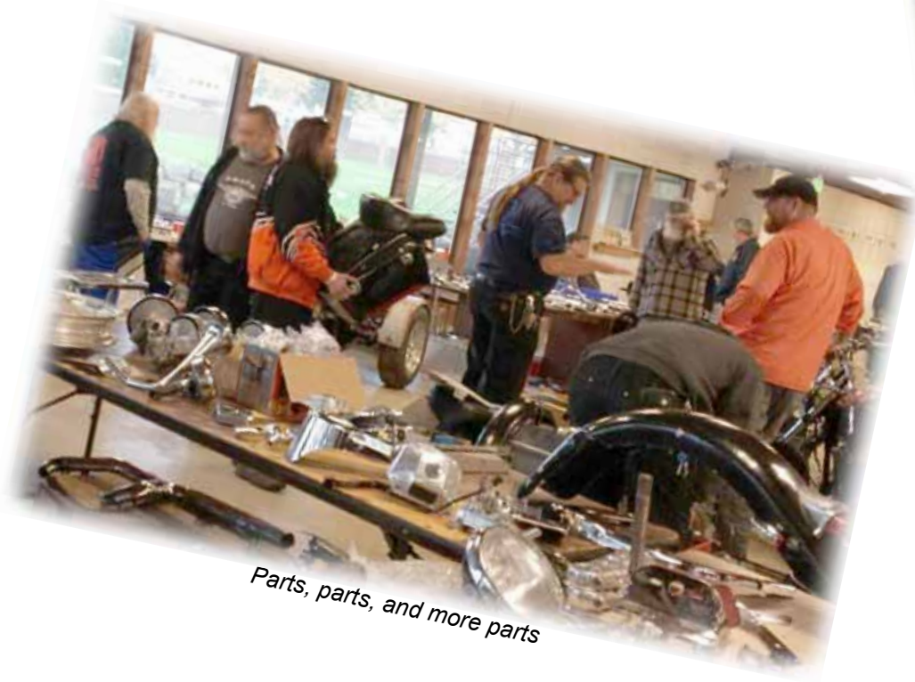
Parts, parts, and more parts