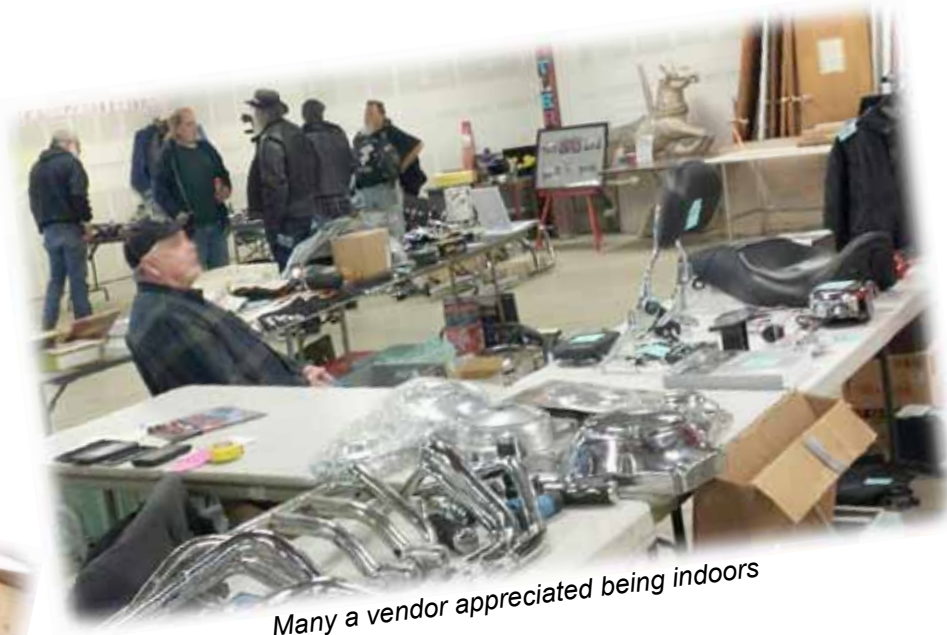
Many a vendor appreciated being indoors