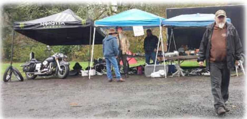
Canopies were needed out doors. (At least it wasn't snowing)