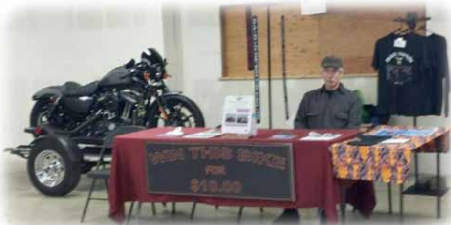
Even the raffle bike made an appearance

The National Coalition of Motorcyclists (N.C.O.M.) proudly welcomes the following motorcycle organizations approved by the N.C.O.M. board of directors on 12 November 2016 as our newest N.C.O.M. member groups, joining in unity with over 2,000 other rider groups, clubs, and associations, including motorcyclists' rights organizations from nearly forty states and over sixty Confederations of Clubs from thirty-seven states and three Canadian provinces: