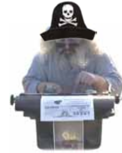
Rot Path crusty ol' editor

Autumn equinox, when day and night are balanced, before sliding into darkness