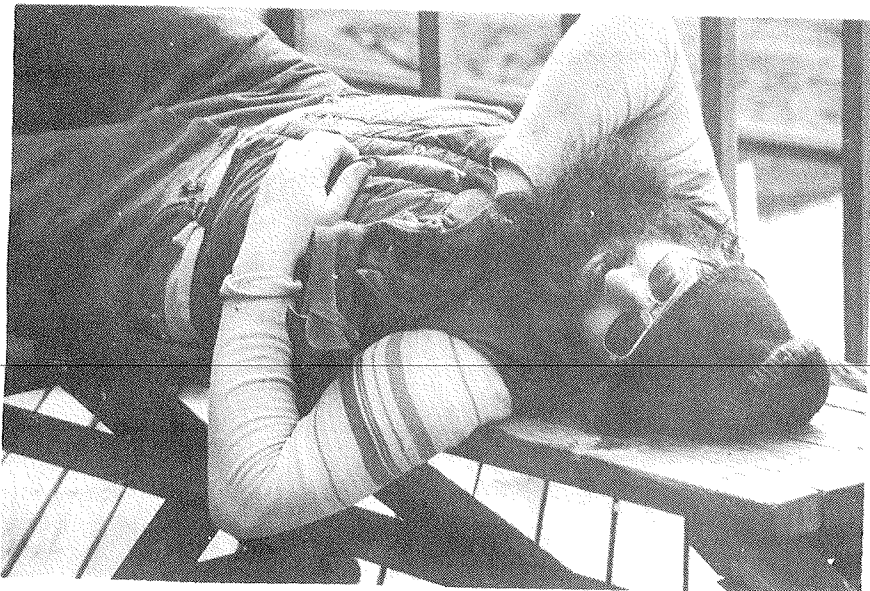
Is this man dead? dead tired, you bet!