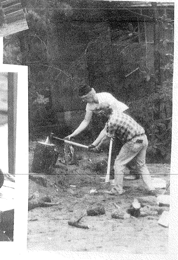
We cut & stacked six cords of wood - starting from the trees - the dead wood was ready to fall, on people's cabins.