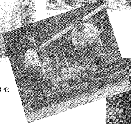
So that's where he was all day!