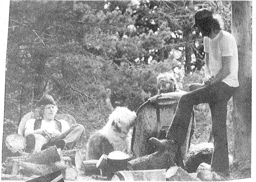
Supervisor, second from left