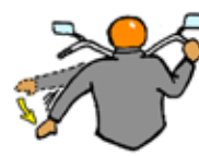
Don't pass me