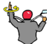
Start your engines