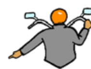
Hazards on the road