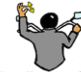
Turn off your turn signals