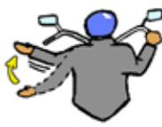
Go ahead and pass me