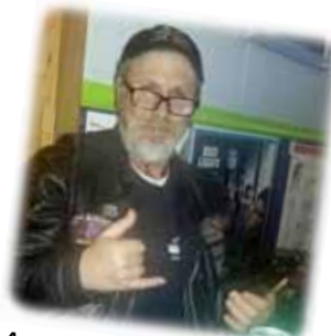
A satisfied participant