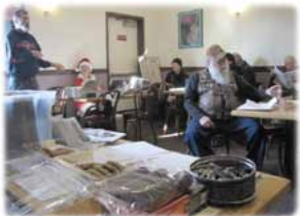
Non-boring state board meeting. ( What a December treat.)