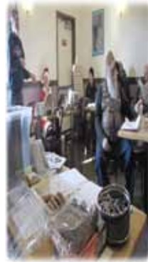
. . . while many of us felt squeezed in.