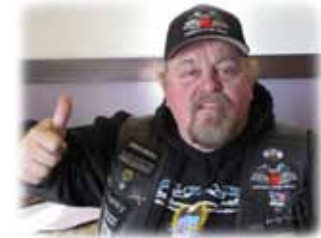
Spanky thought the meeting went well . . .