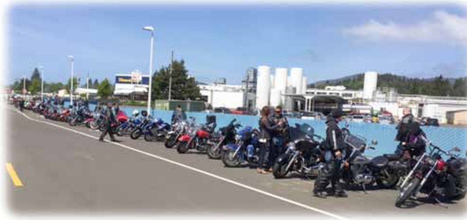
Riders on the Spring Fever Run make their annual stop at the Tillamook Cheese Factory for a little ice cream.

Afterward, some of the members went on a ride to Duffy's Irish Pub in Gray's River, Washington, and then back over on the Westport Ferry, while others went to Mount St. Helens.