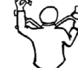
Turn off your turn signals