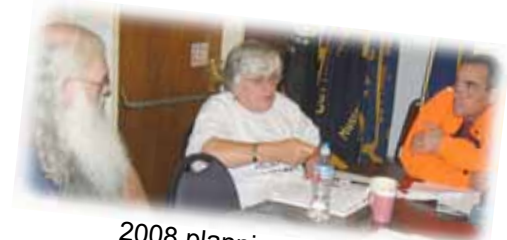
2008 planning session