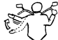
Go ahead and pass me