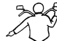
Hazards on the road