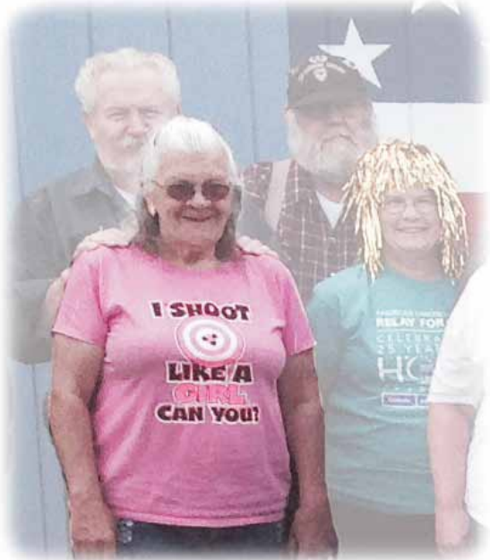
2014 planning group