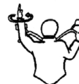
Start your engines