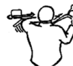
Stop your engines