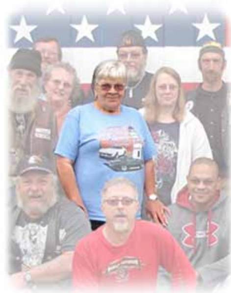
2011 planning group