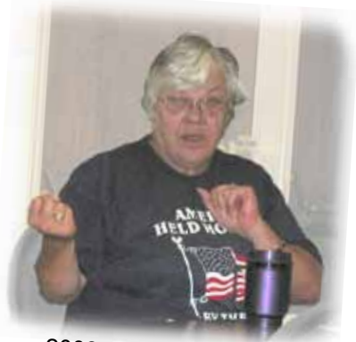
2008 planning session