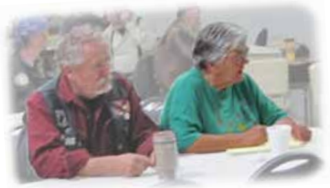
2011 planning session