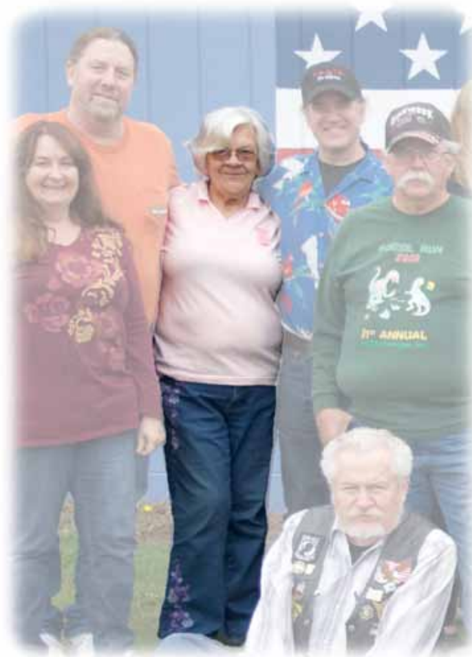
2015 planning group