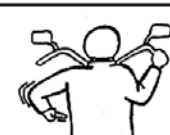
Time for a pit stop