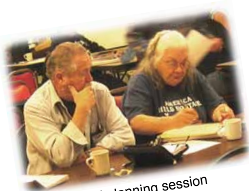
2007 planning session