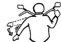
Don't pass me