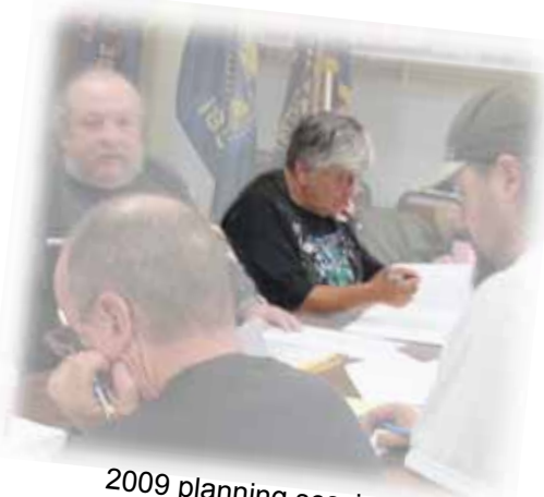
2009 planning session Working on operation manual and by-laws revisions.