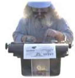
Rot Path crusty ol' editor

You straighten and fold your legs at just the right time and that little action causes you to go higher and higher. It's all in the timing of your leg positions.