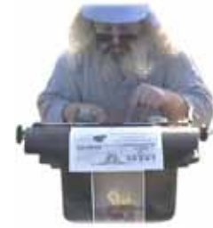
Rot Path crusty ol' editor

Perhaps if c.o.e. had grown up with traffic circles and was used to them, he