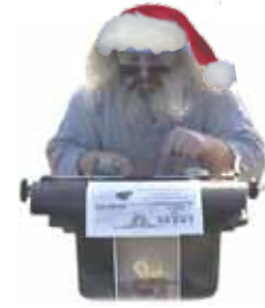
Rot Path crusty ol' editor

now fully into winter, we begin our climb back towards summer