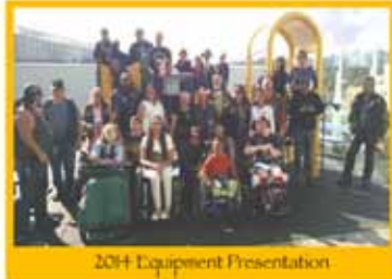
2014 Equipment Presentation

THIS RIDE TO SEE THE KIDS IS NOT A RACE - PLEASE RIDE SAFELY NO WHEELIES, BURNOUTS, SPEEDING OR TYPES OF BEHAVIOR THAT WILL PUT THIS OUTSTANDING ANNUAL EVENT AT RISK.