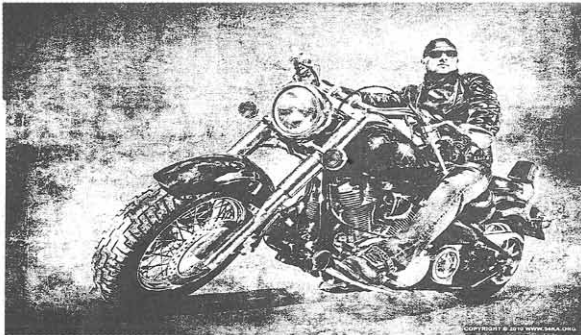
Sanctioned by ABATE of Oregon, Inc. Douglas County Chapter